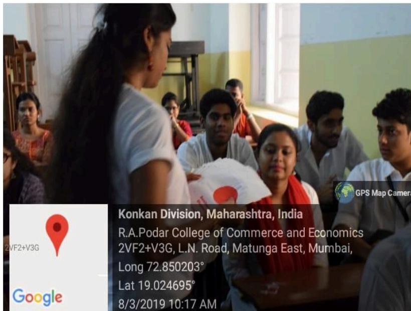
Student volunteers participating in the “Red Dot” campaign promoting safe napkin disposal mechanism