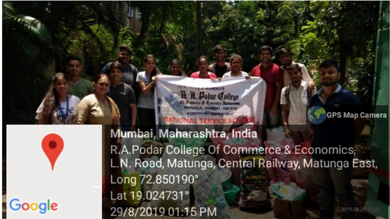
Plastic collection drive by NSS volunteers

Podar : Nurturing Intellect, Creating Personalities.