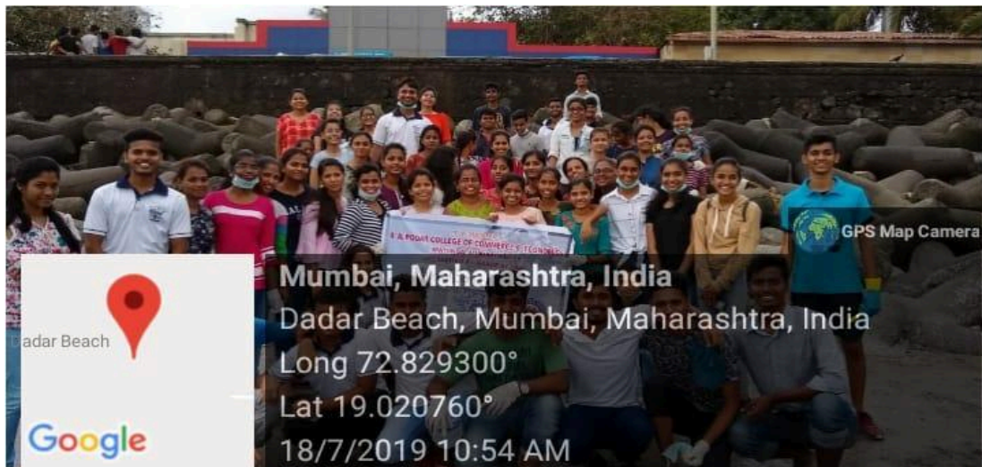
NSS volunteers participating in the Beach Clean campaign at Dadar Chowpatty

Podar : Nurturing Intellect, Creating Personalities.