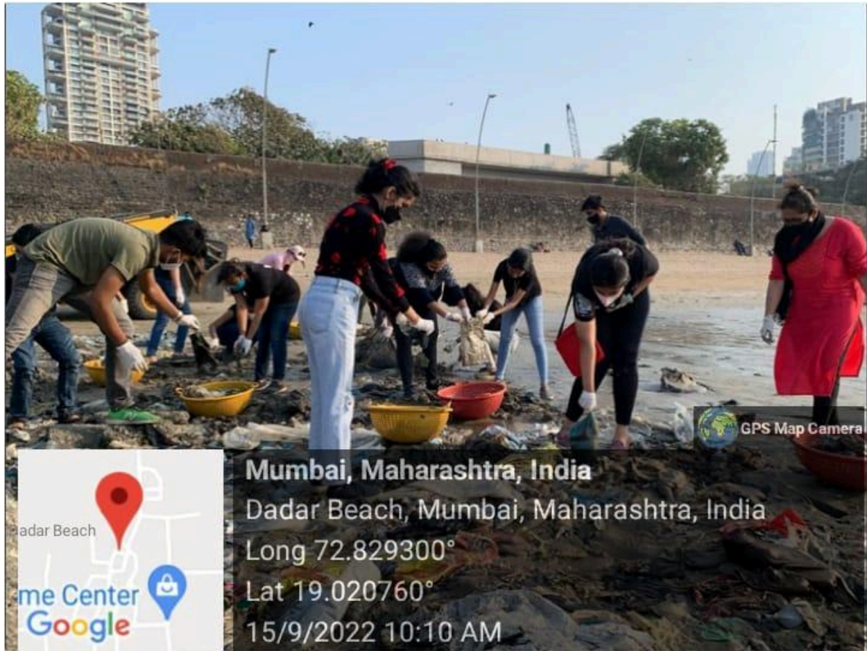
NSS volunteers participating in the Beach Clean campaign at Dadar Chowpatty