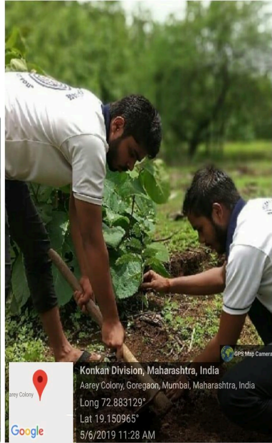
Tree plantation by NSS volunteers at Aarey Colony