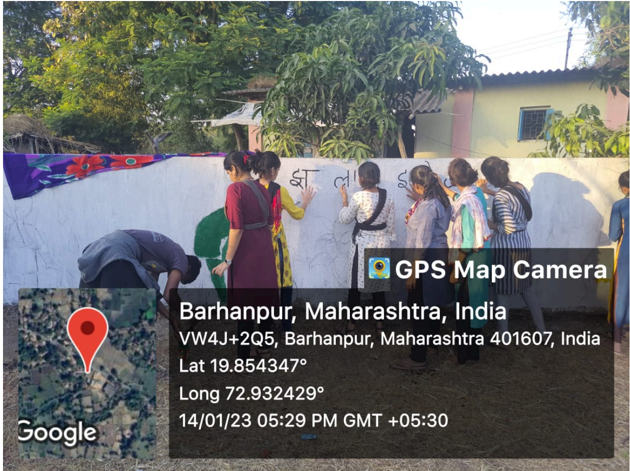
Wall painting by NSS volunteers during the rural camp at Barhanpur