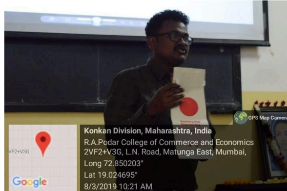
Student volunteers participating in the “Red Dot” campaign promoting safe napkin disposal mechanism