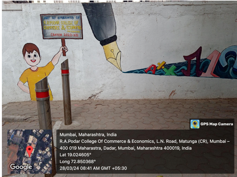
Outside Wall painted by students of R.A. Podar College